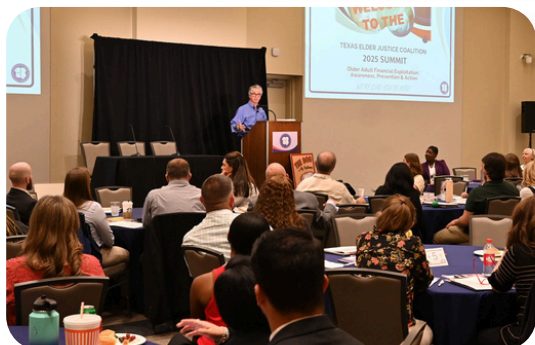
2025 Texas Elder Justice Coalition Summit Attendees